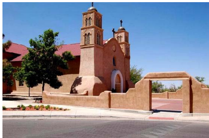
Chapel of Loretto