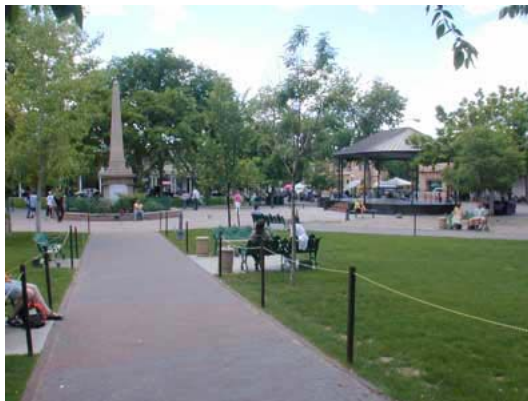
“The Plaza”, Santa Fe

Arrival in Santa Fe will begin at a lifesize bronze diorama of the “Santa Fe Passage”. Then we will kick off our visit to Santa Fe with a walking tour of historic Santa Fe, the oldest capital city in the United States. We’ll see the San Miguel Mission, the oldest church in America, (1610), and the French Romanesque styled Chapel of Loretto with the “Miraculous Spiral Staircase”, which legend says was constructed or inspired by St. Joseph the Carpenter, was built sometime between 1877 and 1881. It took at least six months to build, and has two 360 degree turns with no visible means of support