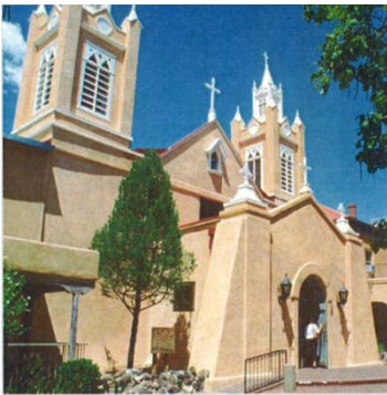
San Felipe de Neri Church in Old Town