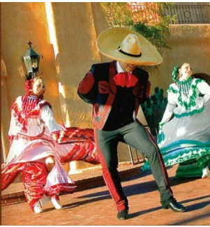
"Old town" Fun and Culture

Our adventure begins at the hotel with a 9:30 pick up. There will be a short driving tour of Old Town, the Historic District, where you will see such sights as Albuquerque Museum, the Museum of Natural History, the Explora Science center and the Balloon Museum.