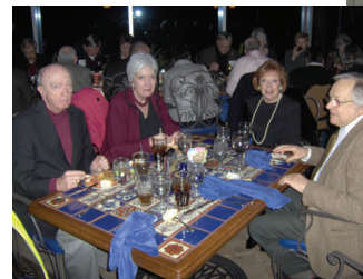
Friends catch up at dinner — Gaylord Texan Resort, Lake Grapevine, Texas