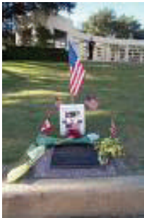
JFK Memorial — Dallas