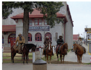
The flavor of the Old West — Fort Worth