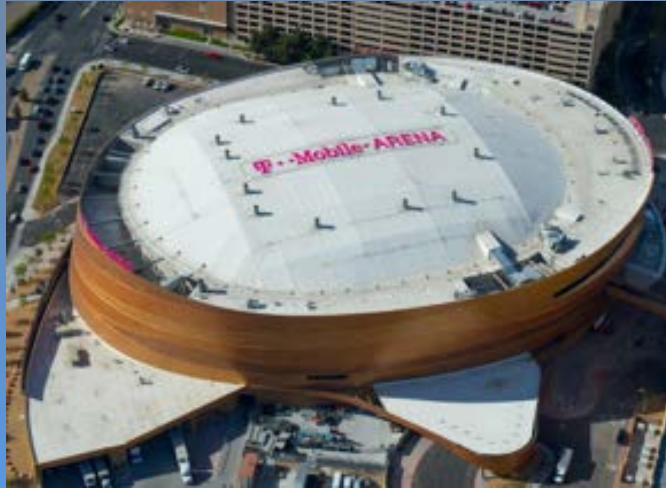
Auburn University – McWhorter School of Building Science

The Roofing Industry ALLIANCE for Progress