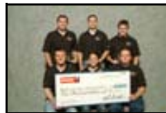
Arizona State University