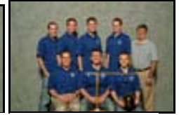
Brigham Young University