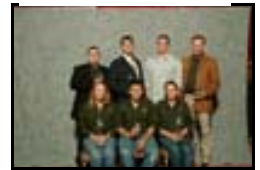
Colorado State University