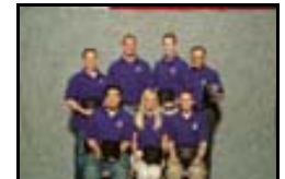
University of Washington