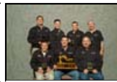
Boise State University