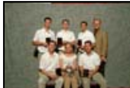
California Polytechnic State University