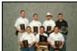
California State University Sacramento