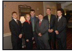
University of Cincinnati