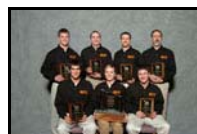
Oregon State— Heavy Civil