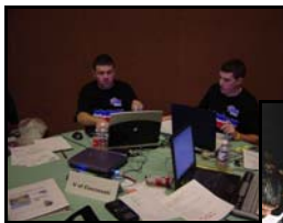
University of Cincinnati