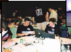
Colorado State University